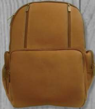
Rover Backpack #93329 (13" x 4" x 16")