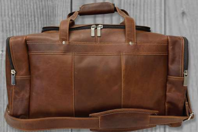
Roswell Duffle #95594 (19.5" x 9.5" x 10")