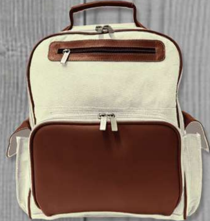
Cabo Backpack #94452 (15" x 8" x 17")