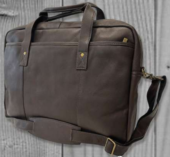
Sport Brief #95056 (19.5" x 13.5" x 3.5")