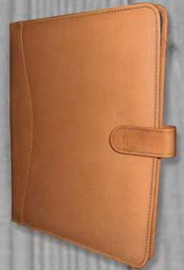
Tablet Cover #95008 (8" x 9.75")