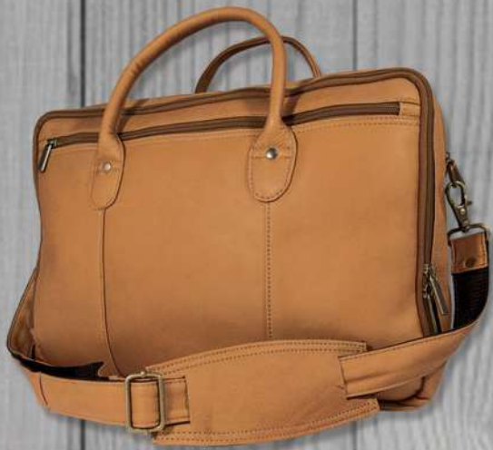
Standard Brief #92789 (15" x 4.5" x 11")