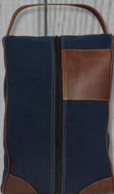
Charter Shoe Bag #94691 (9.25" x 4.5" x 13.5")