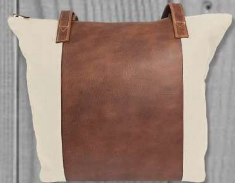
Panama Tote #94401 (11.5" x 5" x 12.5")