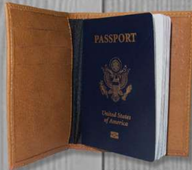
Passport Wallet #95191 (4.5" x 5.5")