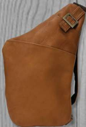
Truckin Sling Pouch #90274 (14" x 8.5")