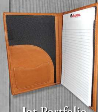
Jot Portfolio #96039 (6.25" x 8.75")