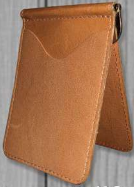
Money Billfold #90155 (4" x 2.75")