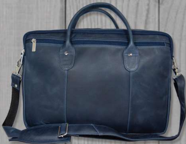
Pacesetter Brief #92178 (15"x 4.5"x 11")