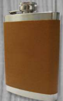
Advantage Flask #96049 (8oz.)