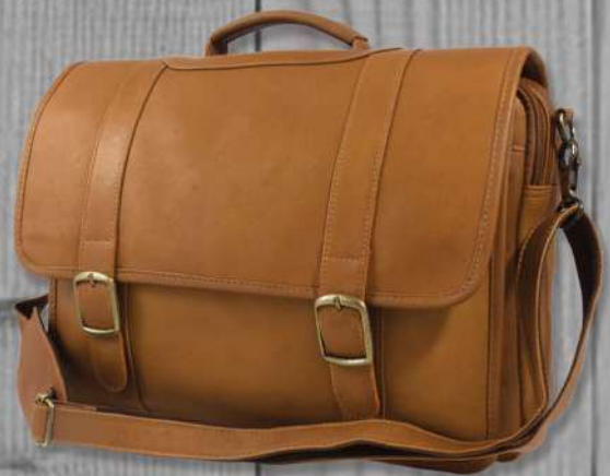
Notebook Case #91199 (15" x 12" x 3.5")