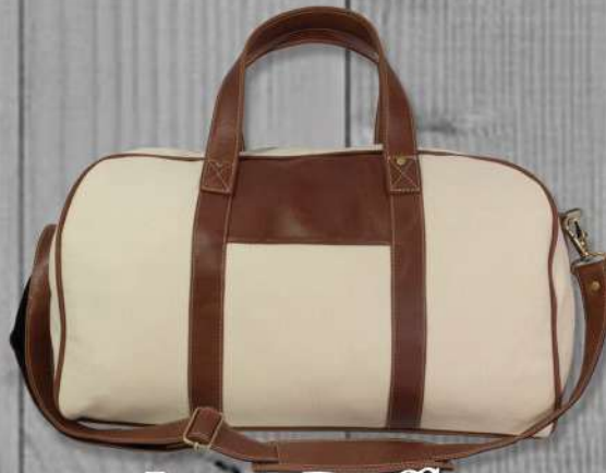
Luau Duffle #94089 (18" x 8" x 12")