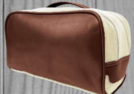
Havana Dop Kit #94494 (10" x 6" x 7")