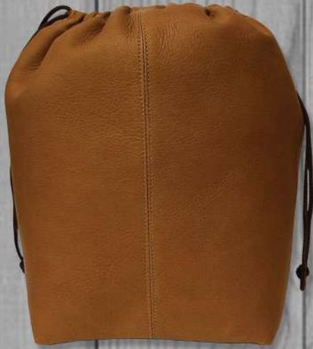
Shag Bag #94726 (8.25" x 9.5" x 3.5")