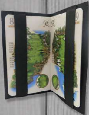
Yardage Cover (Book) #94956 (4.5" x 7.5" Closed)