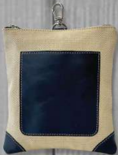
Aria Pouch #99190 (7" x 8")