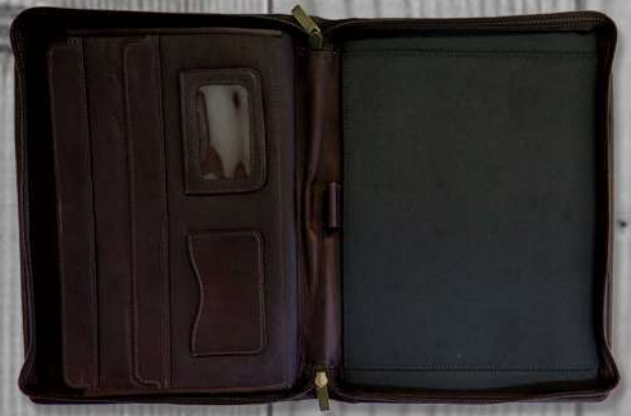
Zipper Portfolio #96089 (13" x 9.5" x 1.25")