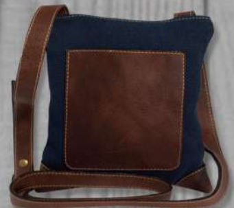
Marina Purse #91193 (7" x 8")