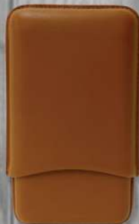
Fore Cigar Case #90149 (7.5" x 4.5" x 2")