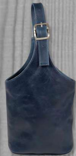
Luna Wine Case #92525 (7.5"x 4"x 15.5")