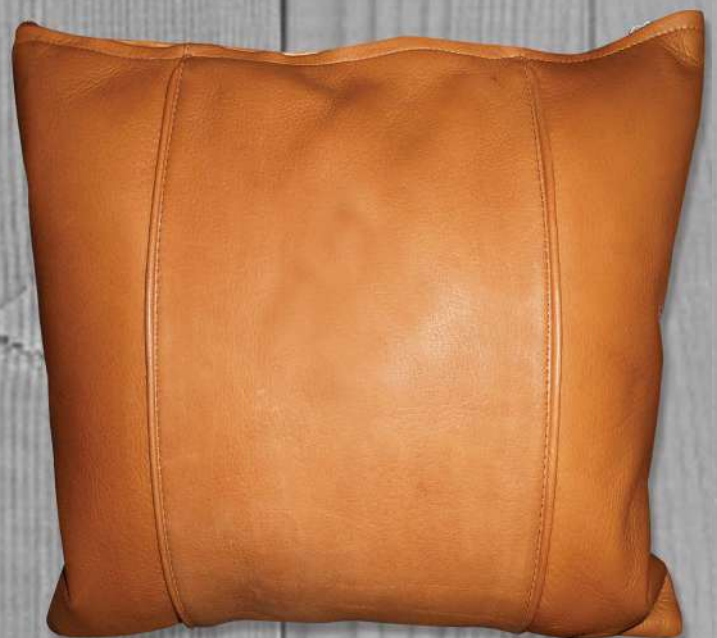
Large Pillow #94901 (18" x 8" x 18")