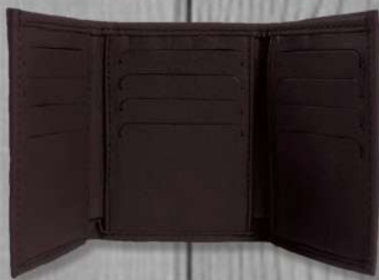
Milo Trifold #92659 (9.5" x 4")