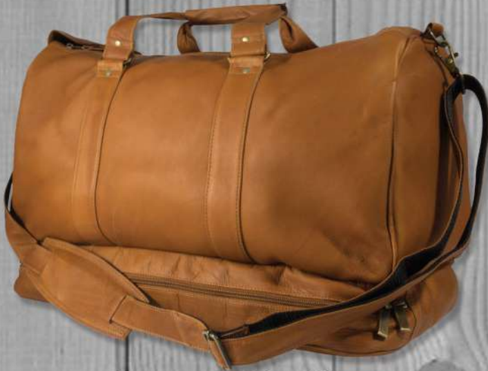
Summit Duffle #90110 (20"x 10.5"x 12")