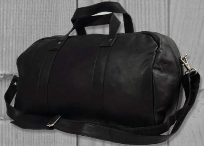
Tour Duffle #93089 (18"x 12" x 8")