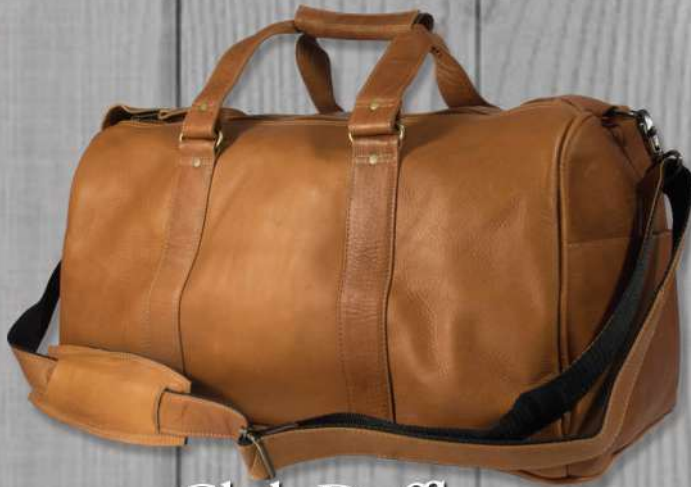
Club Duffle #90172 (20"x 9"x 10")