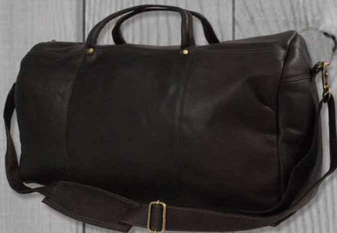
Basic Duffle #95110 (19"x 8.5"x 11")