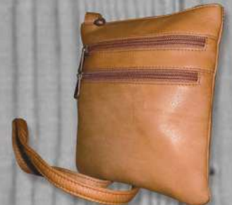
Vegas Purse #97349 (7" x 8")