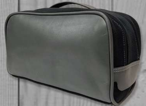
Aces Dop Kit #96081 (10" x 6" x 7")