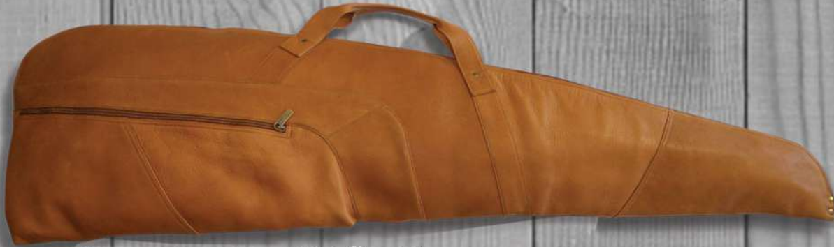
Constitution Rifle Case #95092 (48" x 13.5")