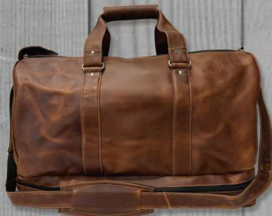
Bronco Duffle #90310 (20" x 12" x 10.5")