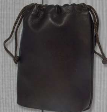
T-Plus Valuables Pouch #90103 (6.75" x 5.25")