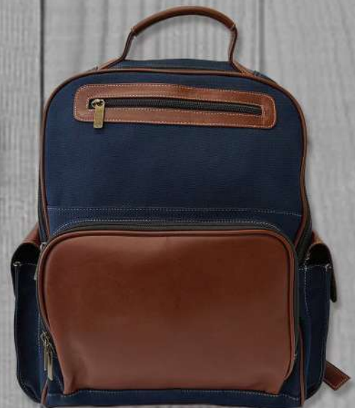
Admiral Backpack #94529 (14" x 8" x 17")