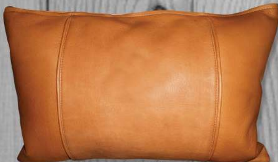
Small Pillow #94902 (18" x 7" x 12")