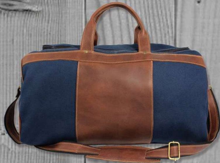
Starboard Duffle #93001 (19" x 11" x 11")