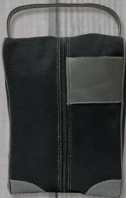
Bootlegger Shoe Bag #96691 (13.5" x 9.25" x 4.5")