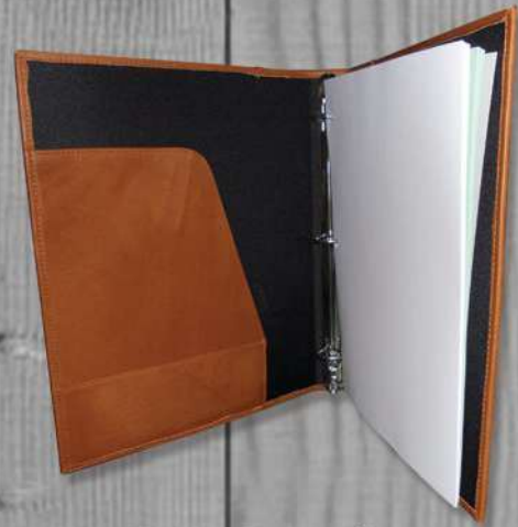
Big Binder #90233 (9.75" x 1.5" x 11.75)