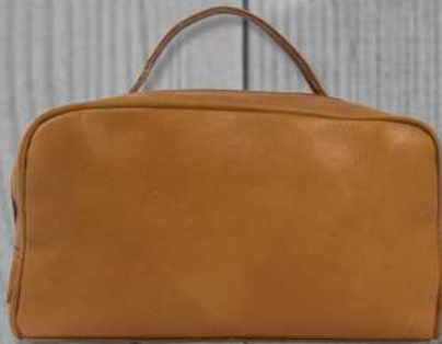
Dop Kit #95089 (10" x 6" x 7")