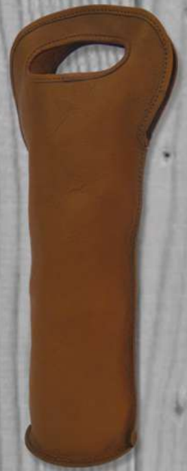
Baco Single Wine Case #90807 (3.75" x 3.75" x 15")