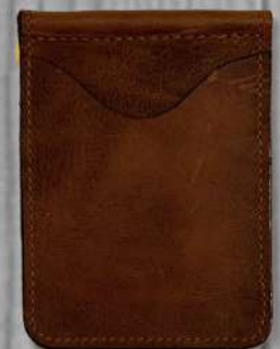
Renegade Billfold #93155 (4"x 2.75")