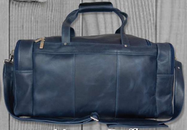
Marquis Duffle #92594 (19.5"x 9.5"x 10")