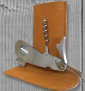
Fiesta Tool #96029 (4.75" x 2.75")