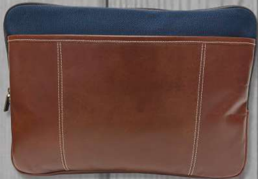
Castaway Sleeve #93526 (15" x 10.5")