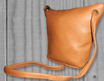
Zip Pouch Purse #95189 (6.5" x 7")