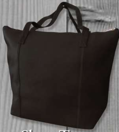
Shop Tote #95409 (11.5" x 5" x 12.5")