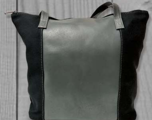
Diva Tote #96401 (11.5" x 5" x 12.5")