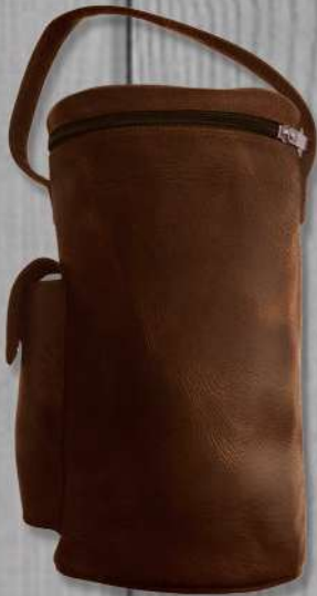
Boone Double Wine #95696 (12.5"x 7"x 3.75")