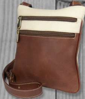
Rio Purse #95349 (7" x 8")