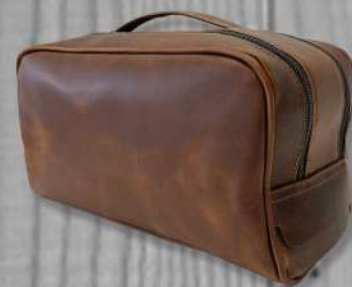
Colt Dop Kit #93508 (10" x 6" x 7")