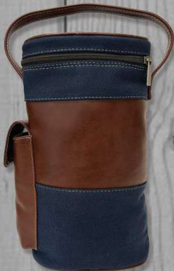
Dockside Wine Case #94186 (12.5" x 7" x 3.75")