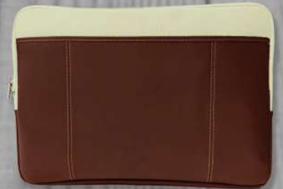
Freeport Sleeve #91252 (15" x 10.5")