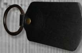
Key Fob #94776 (2.5" x 1.5")