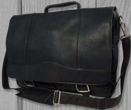
Flap Brief #91819 (15.5" x 11" x 2.5")