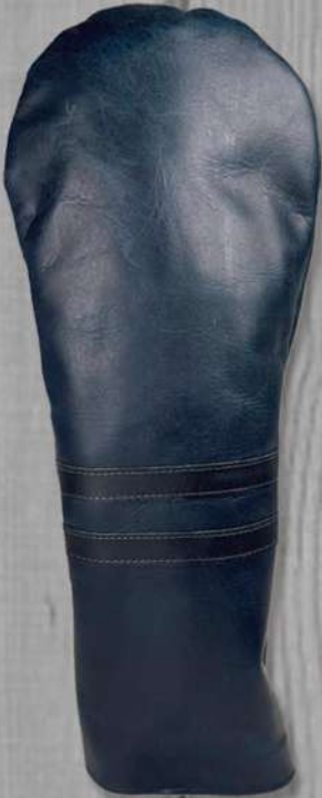
Bolo Driver Cover #92528 (7" x 4.5" x 15.5")