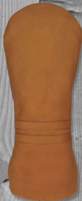
Driver Cover #95286 (7" x 4.5" x 15.5")