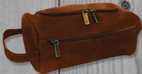
Blaze Travel Kit #95417 (10" x 5" x 6")