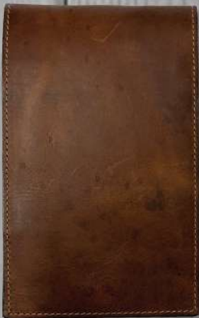
Wrangler Yardage Cover #95494 (7.5"x 4.5" Closed)