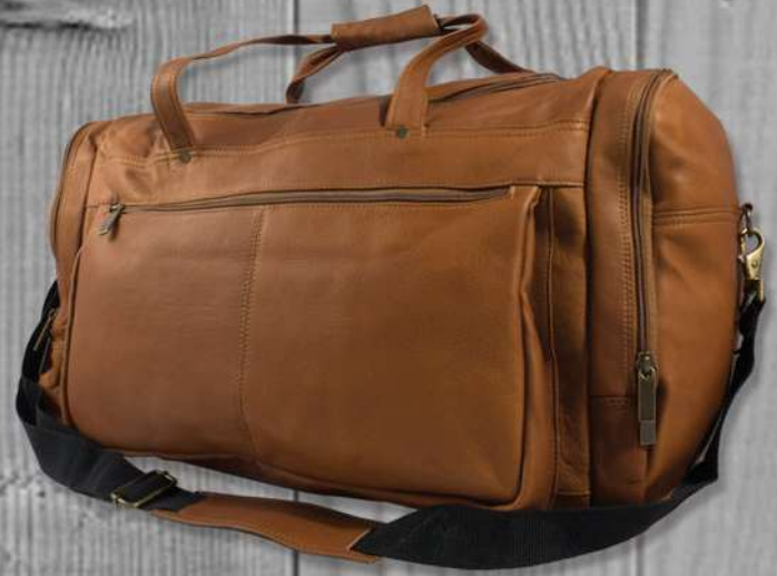
Players Duffle #94958 (21"x 11"x 13.5")