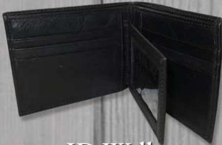
ID Wallet #90178 (4.25" x 3.5")