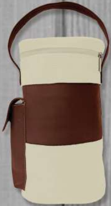
Bimini Wine Case #94496 (12.5" x 7" x 3.75")