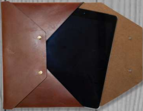
Stash Tablet Case #82145 (8.25" x 10.5")