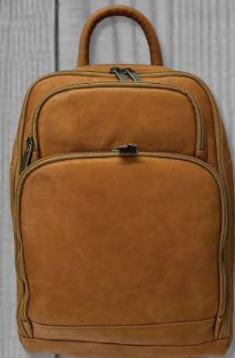
Journey One Strap Backpack #90275 (15" x 11" x 4.5")