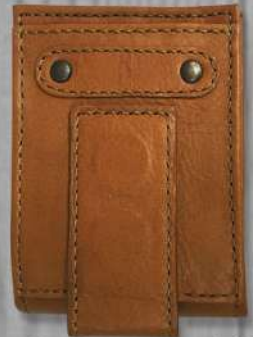
Cayo Magnetic Wallet #93319 (4" x 3")