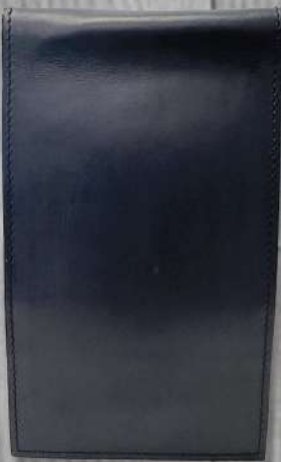
Eagle Yardage Cover #92941 (4.5" x 7.5")