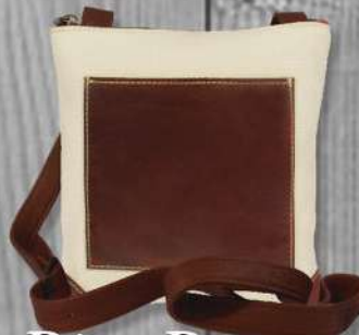
Riva Purse #95193 (7" x 8")