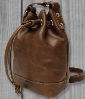
Ella Bucket Crossbody #95276 (8" x 5.5" x 3.5")