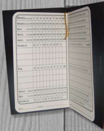
Birdie Clip Card Holder #92514 (6.5" x 4.5")