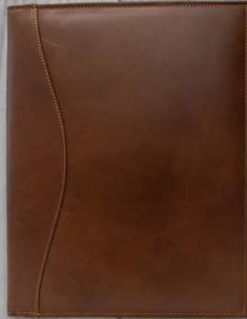
Denver Portfolio #95600 (9.5"x 12.5")