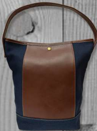
Cart Tote #95390 (7" x 9" x 5.5")