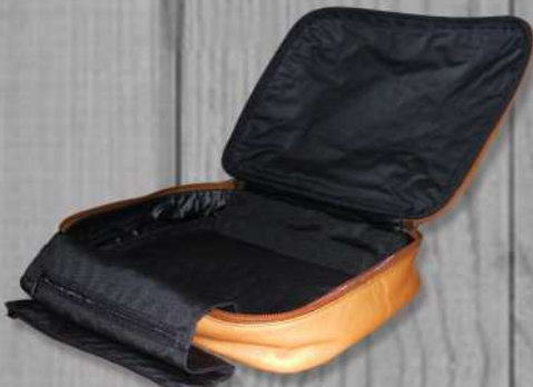
Executive Travel Case #90213 (12" x 9.5" x 2.5")