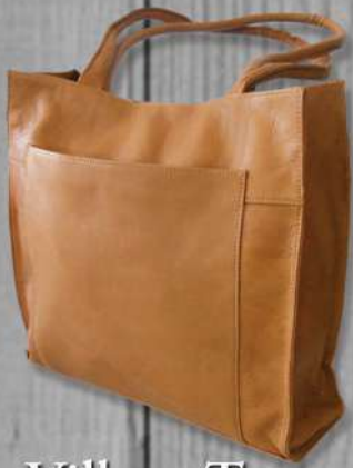
Village Tote #95419 (12.5" x 12" x 4")