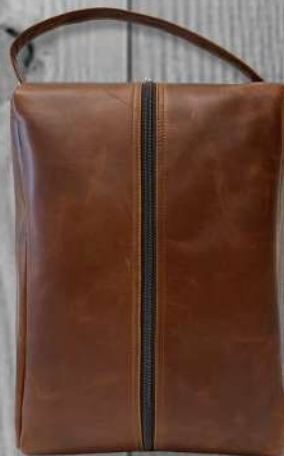
Maverick Shoe Bag #95699 (9.25" x 4.5" x 13.5")