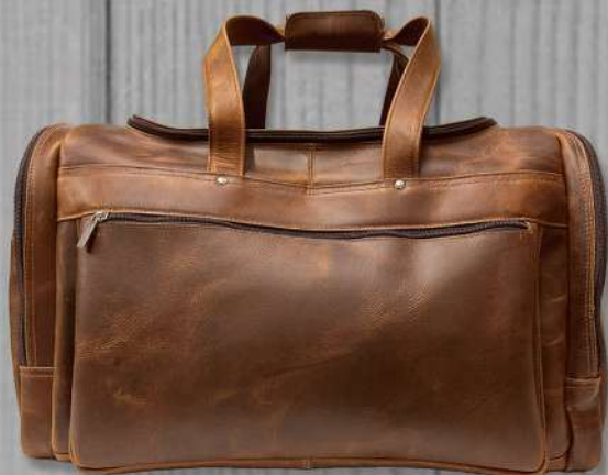
Rebel Duffle #92149 (20" x 10" x 14")