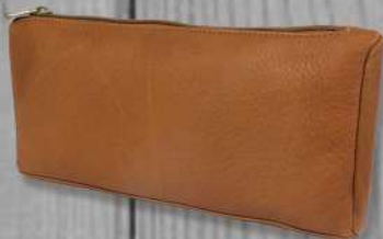
Omni Pouch #95045 (10.5" x 1.5" x 5.25")