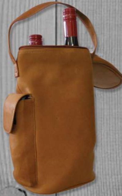
Double Wine Case #91186 (12.5" x 7" x 3.75")