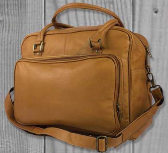
Cruise Zip Tote #95147 (16" x 12" x 10")