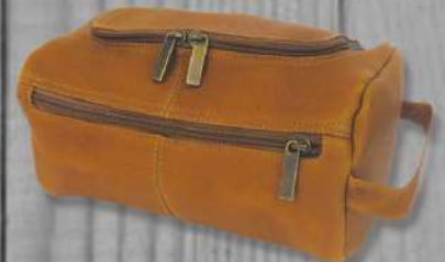
Groomsman Kit #94179 (10" x 5" x 6")