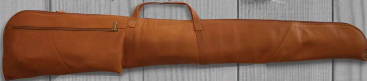
Liberty Shotgun Case #95091 (53" x 10")