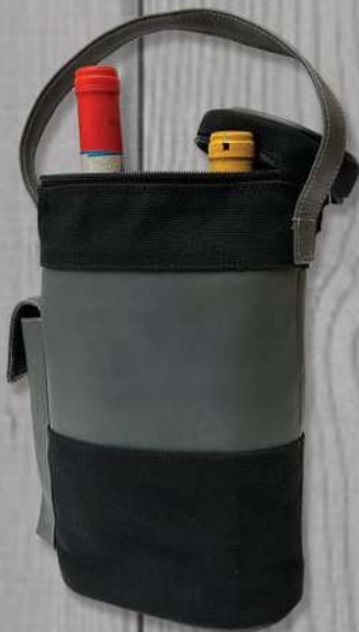
Double Trouble #96186 (12.5" x 7" x 3.75")