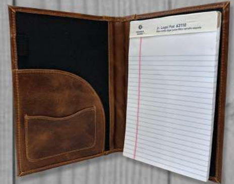
Pecos Portfolio #95603 (6.25"x 8.75")