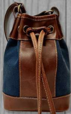
Brooke Bucket Crossbody #94277 (11" x 8.5" x 5")