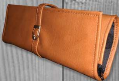
Jewel Case #94999 (9" x 4" x 2")