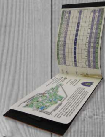
Clip Scorecard (Flip) #94928 (7.5" x 4.5" Closed)