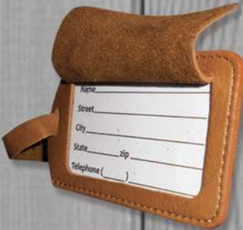
Luggage Tag #94807 (5" x 2.5")