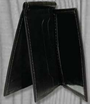
Two Fold #94782 (4" x 2.75")