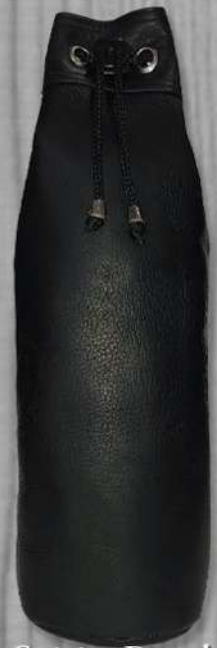
Spirits Pouch #95230 (13.5" x 4" Diam)