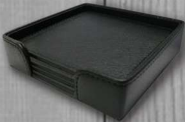
Coaster Set #96019 (4.25" x 4.25" x 1")