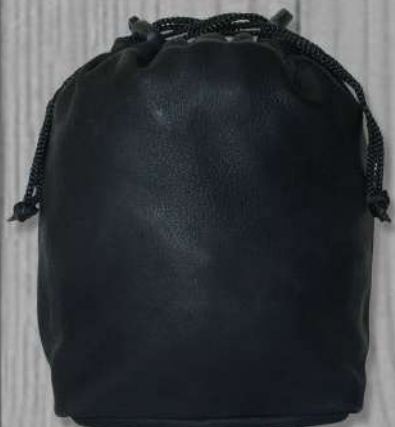
Pro Pouch #94931 (7.5" x 3.5" x 7.5")