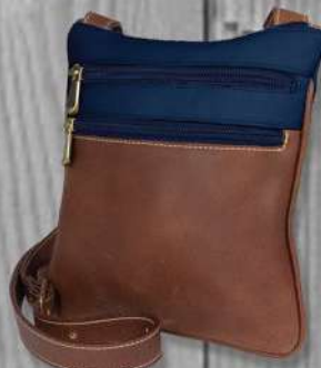
Cayman Purse #94349 (7" x 8")