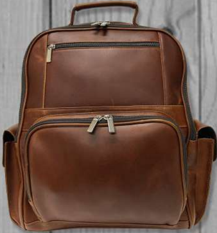
Outlaw Backpack #95352 (14" x 8" x 17")