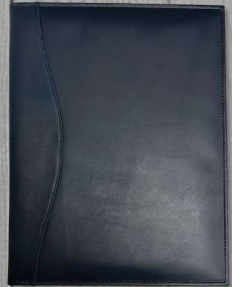
Nobleman Portfolio #92600 (9.5" x 12.5")