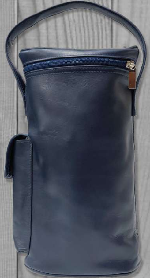
Amor Double Wine Case #92186 (12.5" x 7" x 3.75")