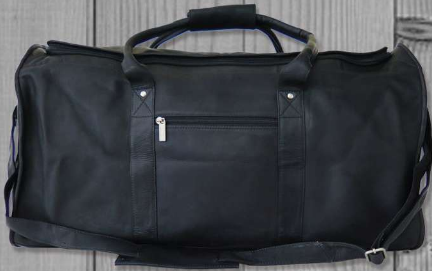
Expedition Duffle #93049 (25" x 10" x 14")