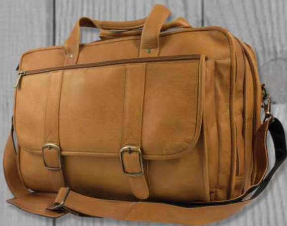
Partners Brief #91009 (17" x 13.5" x 8.5")