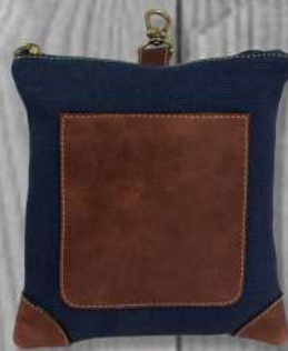
Leeward Pouch #91190 (7" x 8")