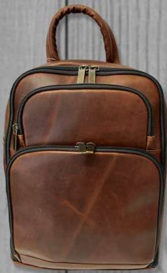
Buster One Strap Backpack #95275 (15"x 11"x 4.5")