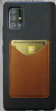
Phone Billfold #95247 (2.5" x 3.5")