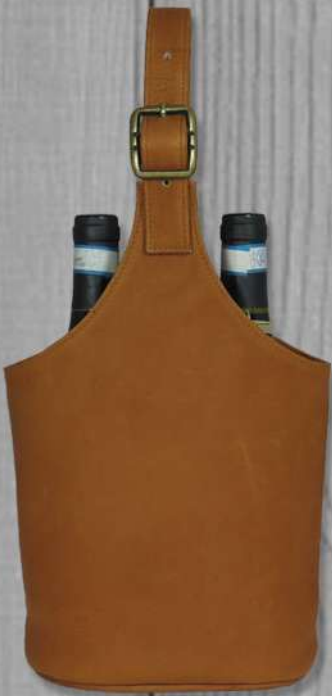
Napa Double Wine Case #95252 (7.5" x 4" x 15.5")