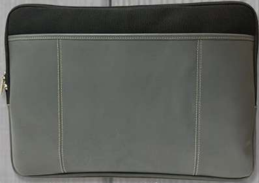
Recon Sleeve #96526 (15" x 10.5")