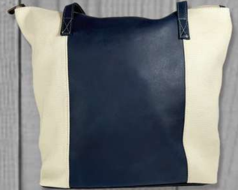
Roma Tote #99404 (11.5" x 5" x 12.5")