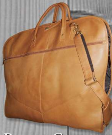
Regent Garment Bag #92169 (23.5" x 42" x 1.5")