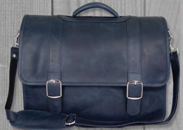
Aristocrat Tech Case #92119 (15"x 3.5"x 12")