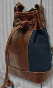
Betsy Mini Bucket #94276 (8" x 5.5" x 3.5")