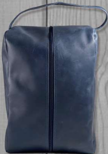
Fairway Shoe Bag #98169 (9.25"x 4.5"x 13.5")