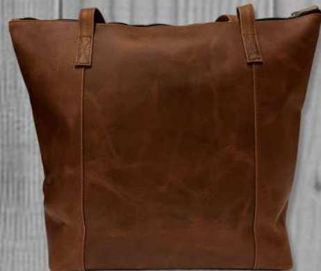
Cheyenne Tote #92154 (11.5" x 5" x 12.5")

Our collection of Hampton Leather adorns the initial 3 pages of our catalog including the cover.