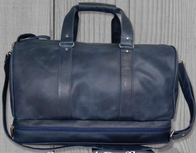
Concord Duffle #92110 (20"x 10.5"x 12")