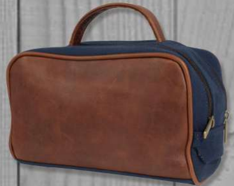
Cabin Dop Kit #95081 (10" x 6" x 7")