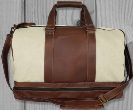
Calypso Duffle #90510 (20" x 10.5" x 12")