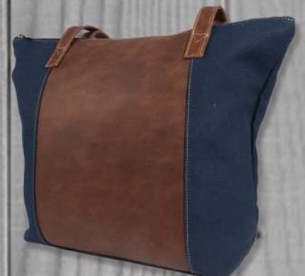
Port Tote #95401 (11.5" x 5" x 12.5")