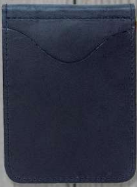
Chill Billfold #92155 (2.75" x 4")