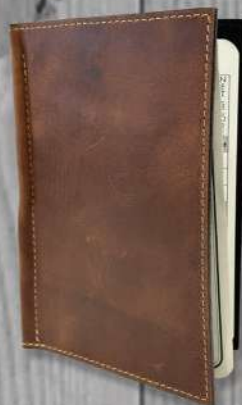
Carson Pocket Clip #95514 (6.5"x 4.5")