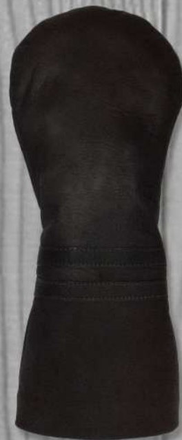
Wood Cover #95186 (5.5" x 3.5" x 13")