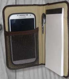
Smart Pocket Plus #92506 (4.5" x 7")