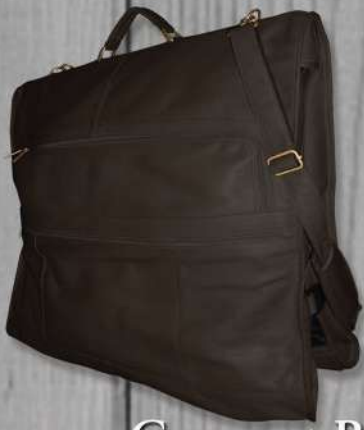
Reserve Garment Bag #92039 (24" x 42" x 3")