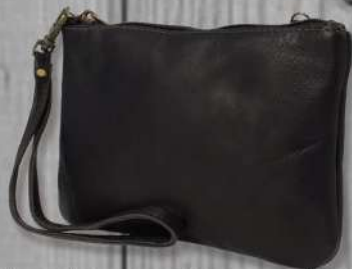
Stadium Purse Plus #95109 (7.5" x 5")