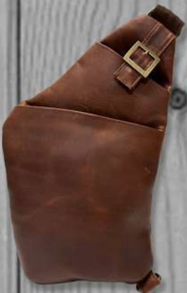
Cassidy Sling Pouch #95274 (14" x 8.5")