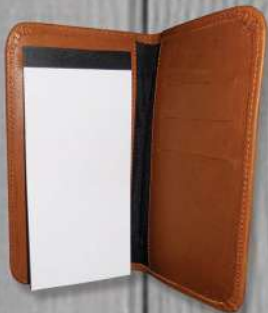
Pocket Manager #90175 (4" x 7")