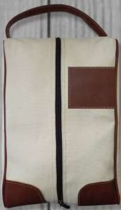
Paradise Shoe Bag #90469 (9.25" x 4.5" x 13.5")