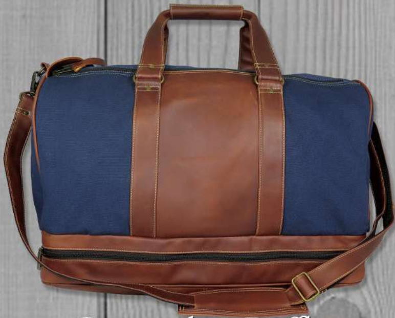
Commodore Duffle #90410 (20" x 10.5" x 12")