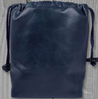
Monte Pro Pouch #92493 (7.5" x 3.5" x 7.5")