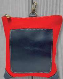
Bravo Pouch #97541 (7" x 8")