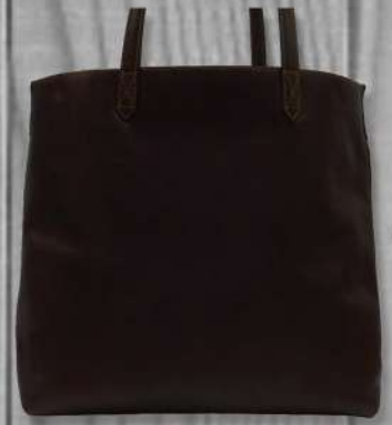
Dia Tote #90621 (10" x 5" x 10")