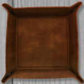
Alamo Tray #95906 (5" x 5")