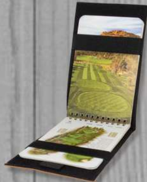
Yardage Cover (Flip) #94941 (7.5" x 4.5" Closed)