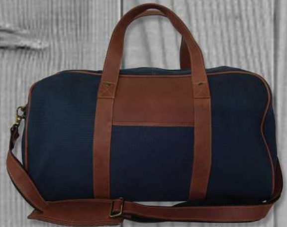
Captain's Duffel #92089 (18" x 12" x 8")