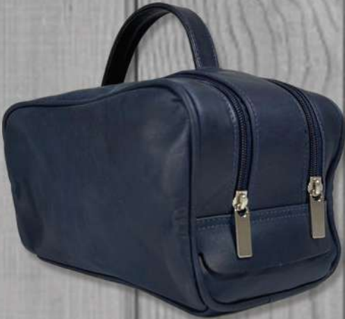
Turo Dop Kit #92508 (10" x 6" x 7")