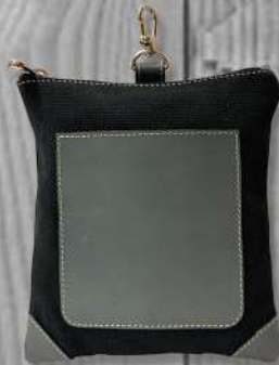
Bounty Pouch #96190 (7" x 8")