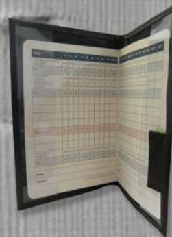
Scorecard Book #90764w (6.5" x 4.5") #90764x (5.75" x 3.3")