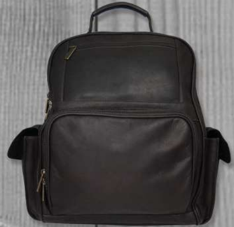
Jet Backpack #93529 (14" x 8" x 17")