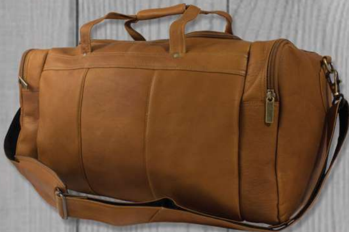
Huntsman Duffle #95094 (19.5" x 9.5" x 10")