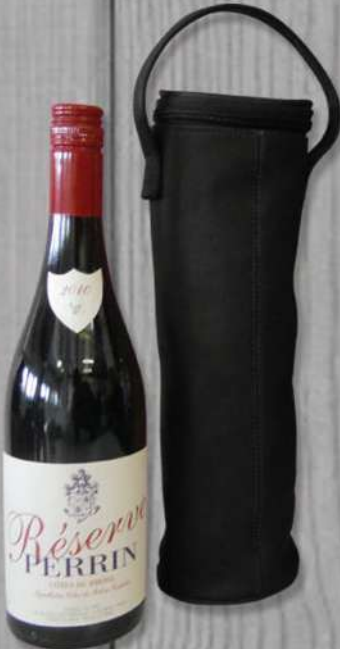
Single Wine Case #90806 (12.5" x 3.5" Diam)