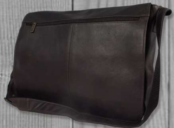
Mail Bag #91899 (16" x 11.5" x 4")