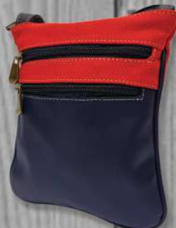
Bella Purse #97349 (7" x 8")