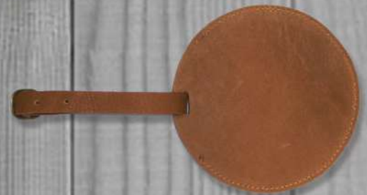
Bag Tag #90637 (4" Diam)