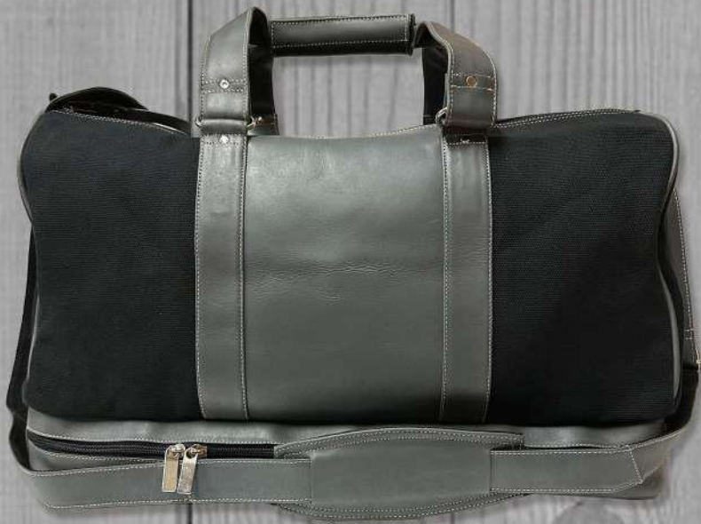
Fortune Duffle #96110 (20" x 12" x 10.5")