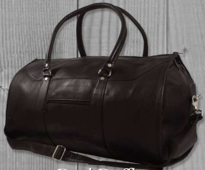
Dual Duffle #93079 (20.25" x 9" x 10")