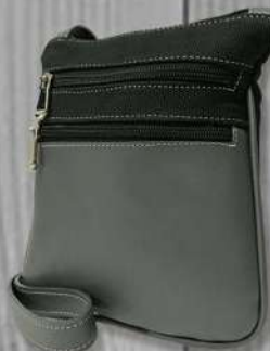
Vixen Purse #96349 (7" x 8")