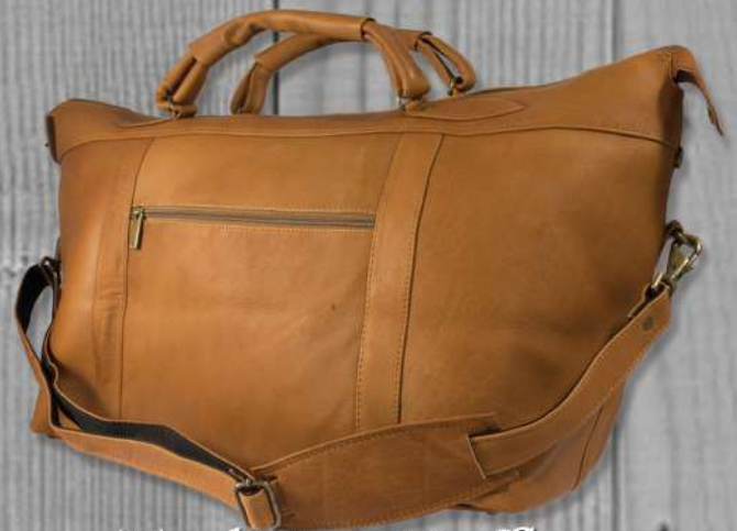
Tradition Duffle #93039 (20"x 14"x 10")