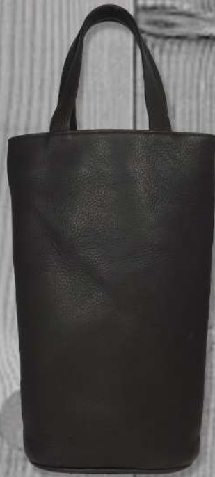
Valley Double Wine Case #95251 (7" x 4" x 18")