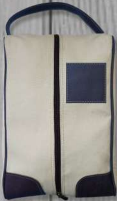
Nova Shoe Bag #99691 (9.25" x 4.5" x 13.5")