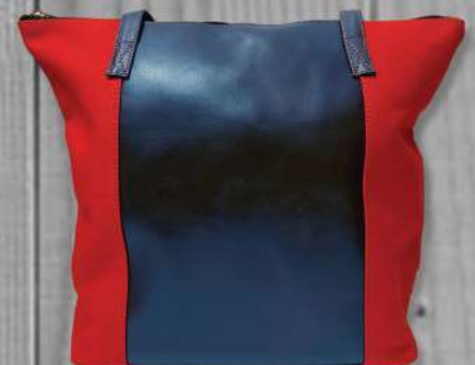
Paloma Tote #97401 (11.5" x 5" x 12.5")