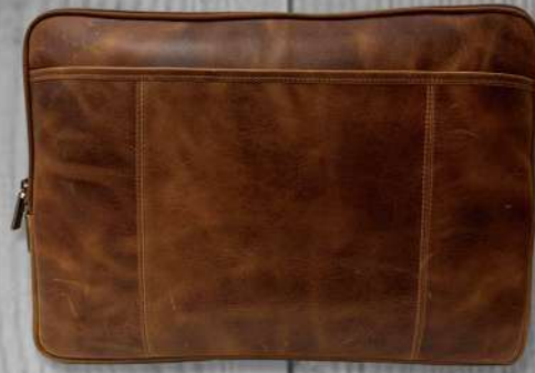
Frontier Sleeve #92526 (15"x 10.5")