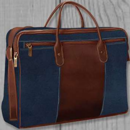
Topside Brief #93789 (15" x 4.5" x 11")