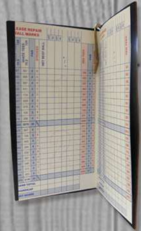
Clip Scorecard (Book) #94929 (4.5" x 7.5" Closed)