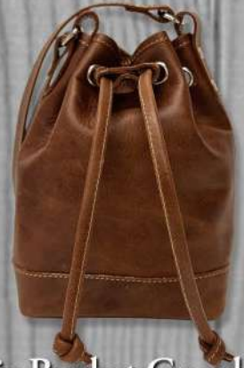
Jessie Bucket Crossbody #95277 (11"x 8.5"x 5")