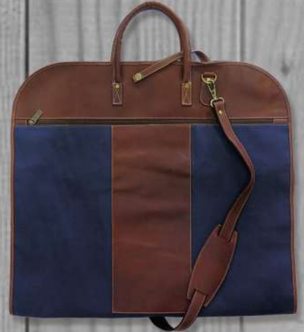
Regatta Garment Bag #94216 (23.5" x 1.5" x 42")