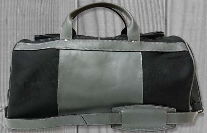
Smuggler Duffle #96001 (19" x 11" x 11")