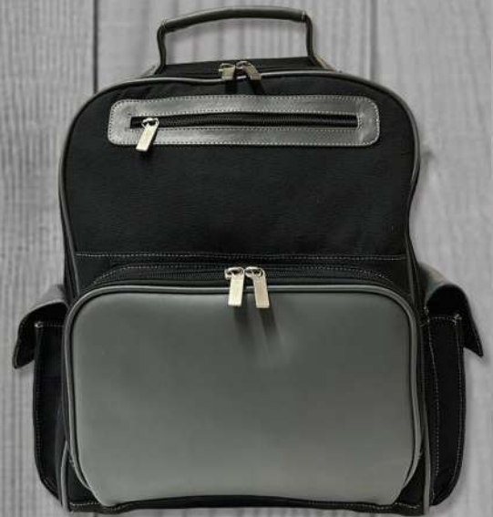
Rustler Backpack #96529 (15" x 8" x 17")