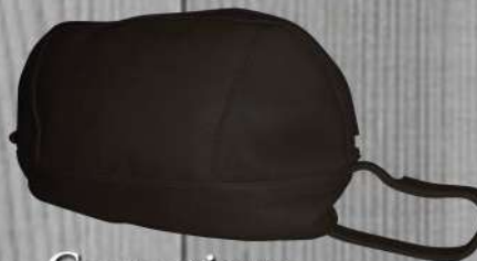
Cosmetique #94199 (10" x 6" x 4")