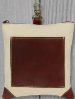
Vida Pouch #95190 (7" x 8")