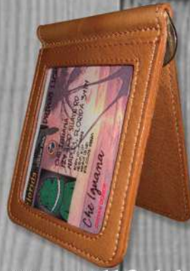
ID Billfold #99125 (4" x 2.75")