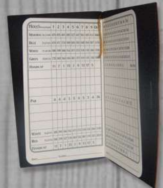
Pocket Clip Scorecard #95140 (6.5" x 4.5")