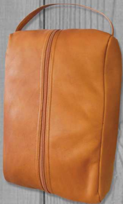
Shoe Bag #90169 (9.25" x 4.5" x 13.5")