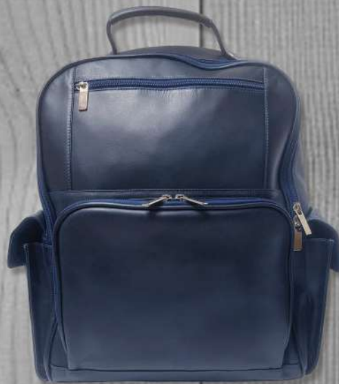
Primo Knapsack #98352 (14"x 8"x 17")