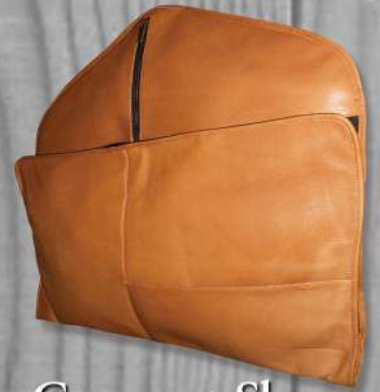
Garment Sleeve #90163 (24" x 39" x 1")