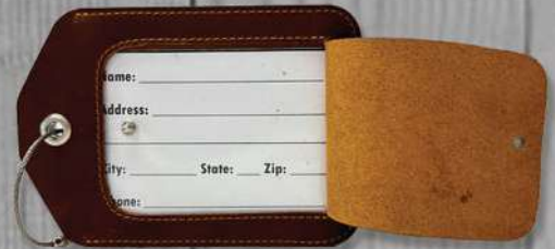
Founders Luggage Tag #95279 (3.5" x 5")