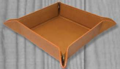
Tray #94906 (5" x 5")