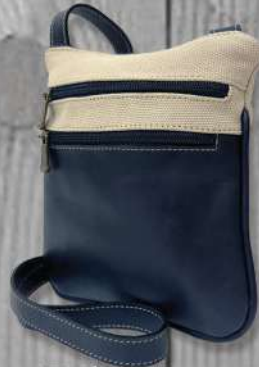
Tula Purse #99349 (7" x 8")