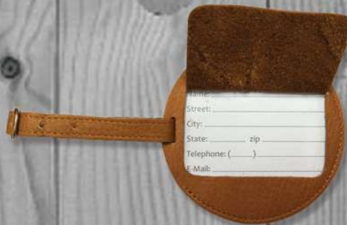
Luxe Bag Tag #95234 (4" Diam)