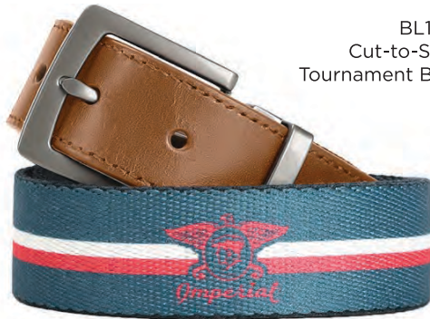
BL105 Cut-to-Size Tournament Belt

24 pc minimum opening order quantity per layout $44 / pc | Domestic production only | Each belt can fit sizes 32 - 44 Every order includes a pair of scissors | Program starts shipping 4/24/23