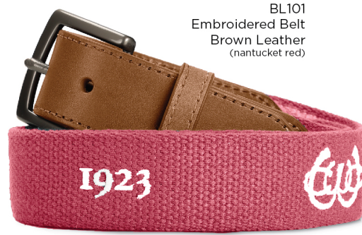
BL101 Embroidered Belt Brown Leather (nantucket red)