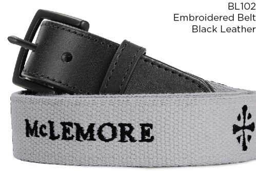
BL102 Embroidered Belt Black Leather

All belts ship on a sized Imperial hanger