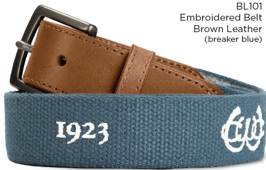
BL101 Embroidered Belt Brown Leather (breaker blue)

The Imperial belt is 1.25" wide and can feature either 1 repeating logo or 2 different logos alternating across premium cotton webbing. Up to 7 embroideries can fit based upon logo and belt size. The belt is finished with full-grain, rich leather, and a solid brass buckle plated in a satin gunmetal or in a matte black finish. Proudly made in the USA.